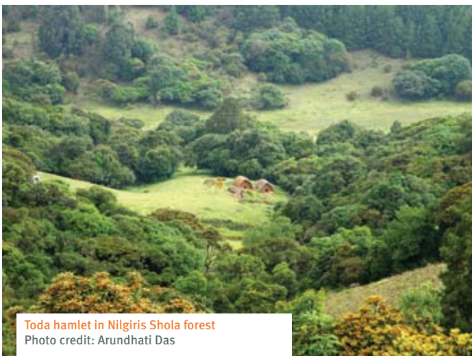
Toda hamlet in Nilgiris Shola forest