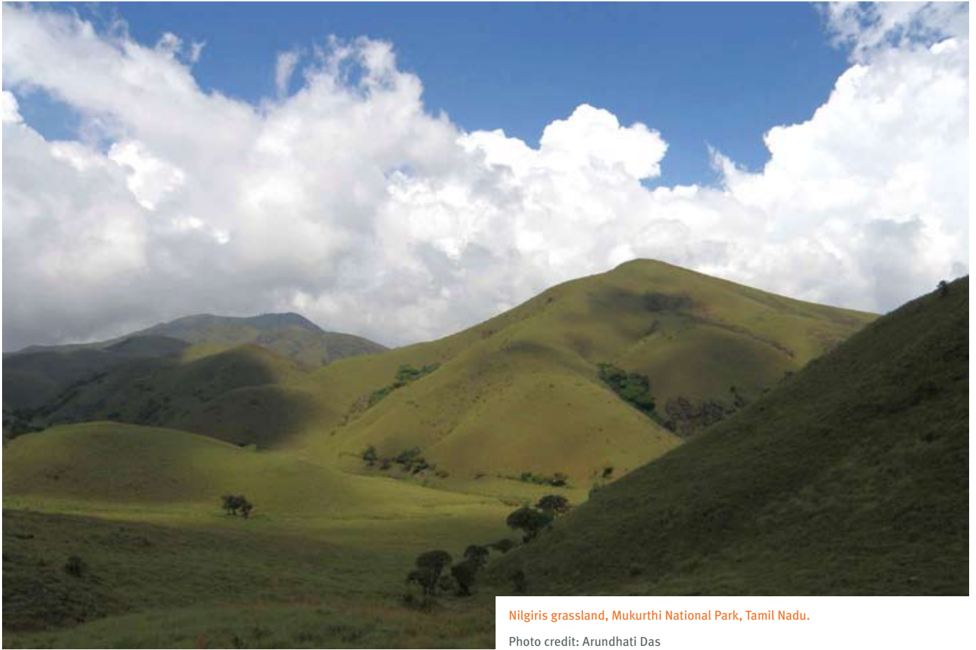
Nilgiris grassland, Mukurthi National Park, Tamil Nadu.