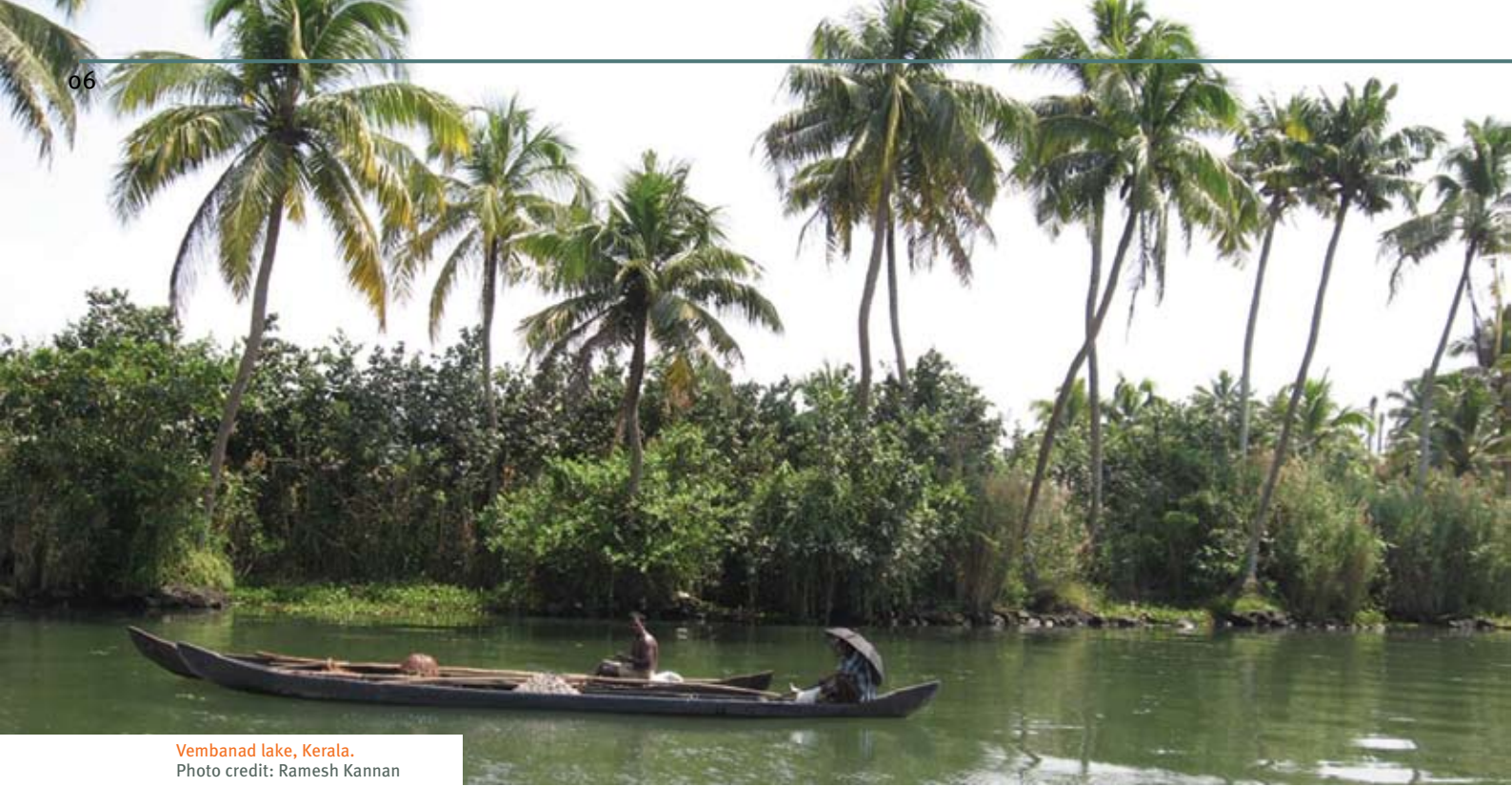
Vembanad lake, Kerala.

On the western coast of Kerala, changes in zooplankton community dynamics and its implications for fishery is being studied. In Western Ghats portions that occur in Gujarat, fleshy fruit resource use by semi-arid communities is being researched.