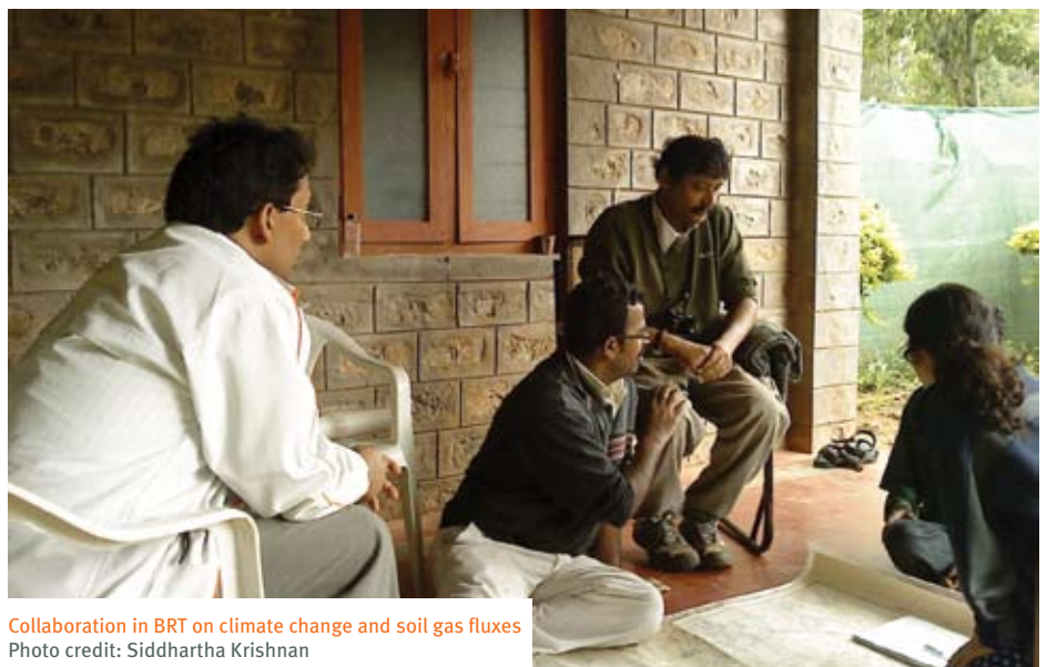
Collaboration in BRT on climate change and soil gas fluxes

ATREE and NORAGRIC are mutually hosting doctoral and Masters Students. Faculty members, doctoral and post doctoral candidates are collaborating with each other. NORAGRIC faculty offer guest lectures to students in ATREE, faculty from ATREE reciprocate. The project seeks to solidify the foundation for a permanent partnership, in which the Indian and Norwegian institutions will exchange scientific personnel and reciprocate. carry out international collaboration on a long term basis.