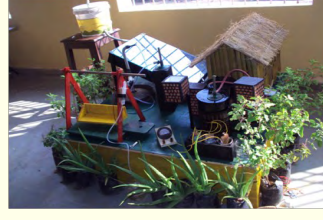
Scientific model : "Conservation at home"

S.D.M. High School, Ujire organized an exhibition to showcase the work of DNA club members and held a meeting to plan the activities for summer vacations. Bat census and Phenology