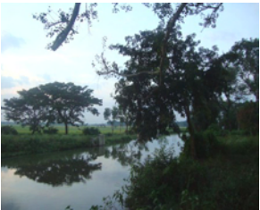
Landscape around Vyasarajapura