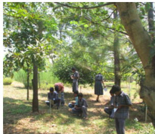
Students at the medicinal plants garden