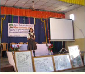
Student participating in the Speech Competition