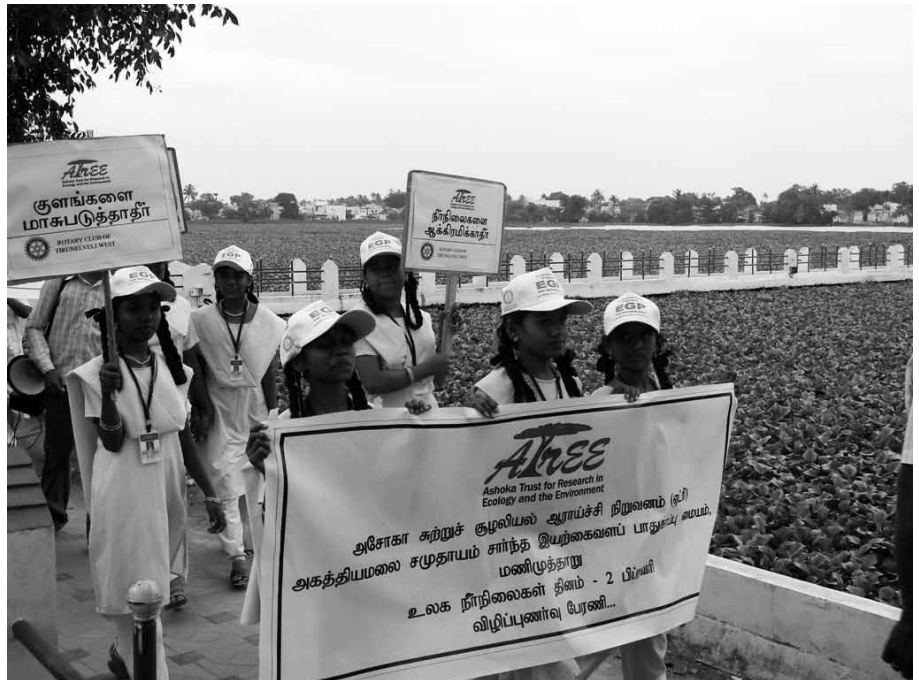
Students leading a procession.

River Tamiraparani and its associated rivers and tanks are a source of drinking water and irrigation for Tuticorin and Tirunelveli districts of