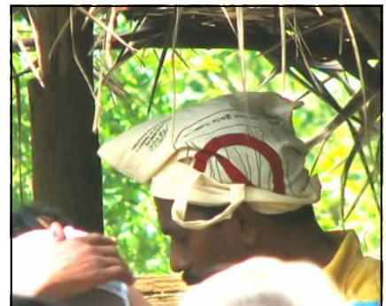
Dual stroke: Cloth bag given by ATREE to replace polythene bags and caps!