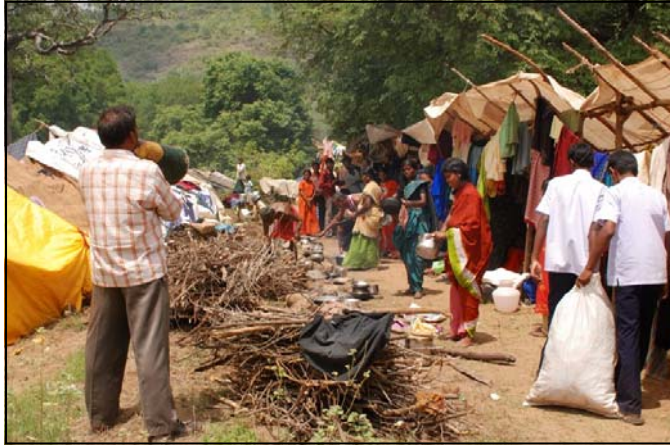
Volunteers collecting garbage from the tents during the 'Clean KMTR Campaign'

I returned to Bangalore with a kind of uncomfortable feeling about the campaign. Strangely, while riding my scooter in Bangalore I witnessed two interesting incidents. One, I saw the dark tinted glass of an expensive car, being