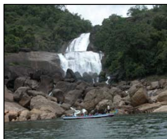
Banatheertham falls, Kariyar

The 'Clean KMTR campaign' effort has now completed 4