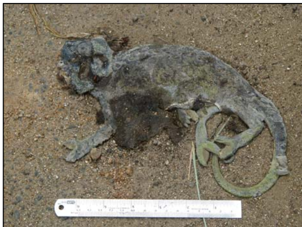
An unlucky chameleon that never made it to the other side of the road.

Roads, irrespective of where they are located cause problems to both people and animals as they can be run over by passing vehicles. While development is the most obvious reason for increased number of roads and the increase in number of vehicles, other seemingly small issues like a pilgrimage where there is a large gathering of people in the name of religion, tradition, culture etc could also cause a significant amount of damage to the ecosystem by killing organisms on roads through their habitat. While larger mammals like tiger or the sambar grab the attention when road kills are spoken of, smaller but ecologically important organisms like the millipedes or the frogs for that matter are not given a second thought. The Sorimuthaian pilgrimage is one such annual religious activity which attracts about 2-3 lakh people using various modes of transport from two wheelers, public busses to hired vehicles including hi class sedans like BMW. All this leads to a huge influx of vehicles into the reserve for over 10 days and due to the high volume, the roads are kept open 24hours leading to a continuous train of vehicles flooding the otherwise peaceful