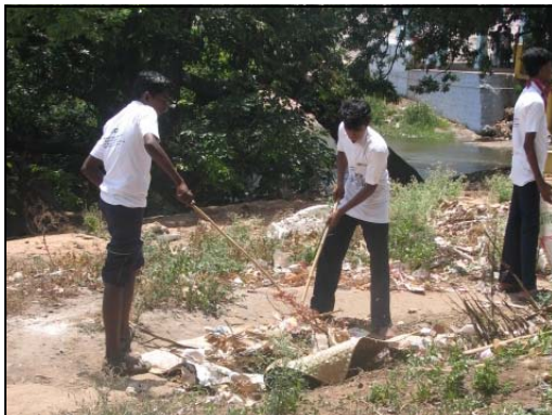
Volunteers at the post-festival clean-up

On August 11th, 2009 ATREE joined hands with Tamil Nadu Forest Department (TNFD), Theerthapathi Hr., Sec., School and Rotary club of Ambasamudram to conduct the post cleanup campaign at Sorimuthaian temple. This is the third time ATREE is conducting this campaign.