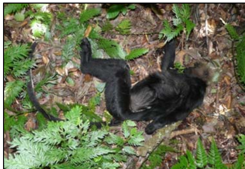
A Nilgiri langur ( Trachypithecus johni ) found electrocuted in KMTR

An elephant death due to electrocution left a shock wave during Sep 09 when it appeared in a daily. However, more than ground dwelling animals, many tree dwelling animals such as Nilgiri langurs, Lion tailed macaque, squirrels,