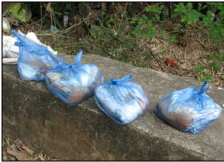
Lunch served in plastic bags for the volunteers of the 'anti-plastic campaign' in KMTR

The 'Clean KMTR' campaign aims at maintaining the forest areas as litter-free as possible. The ban on plastic within the reserve is being implemented with great difficulty. Best possible efforts are put in by the forest department staff, local volunteers and many others in making people aware of the hazards of plastics and asking them to dispose the waste responsibly. Though every thing is done to minimize plastic use there is still some work to do in terms of coordination.