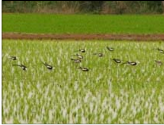
Pheasant-tailed jacana foraging in a paddy field

We observed what the birds feed on and how they fed to check out if these allegations were true. The jacanas picked up minute creatures from the water and never touched the crop. They moved carefully between the crops and