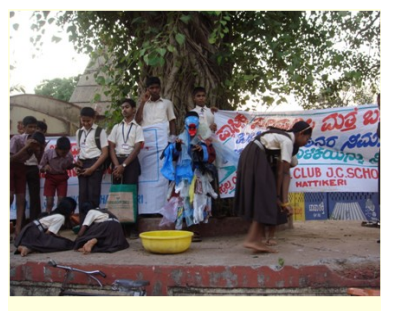
Students enacting a play during Anti-plastic campaign

sumption in the main market area of Ankola Town was carried out by the DNA club members. The members were trained by their coordinator to make bags with old newspapers. Around 50 women